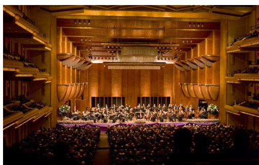
New York Philharmonic Opening Night Review Millennials are Ready to Inherit Our Cultural Institutions

If you think that the only way a concert can be exciting is if there are pyrotechnics, scantily clad pop stars, or a mosh pit of closely touching strangers, then you probably weren't at the opening night gala for the New York Philharmonic on Thursday night. However, even if those are your typical requirements for excitement (either because it's what you love, or it's what our generation loves), it is still possible that you would have found Thursday night's program engaging and yes, perhaps even exciting. Conducted by Alan Gilbert and featuring the legendary virtuosity of violin